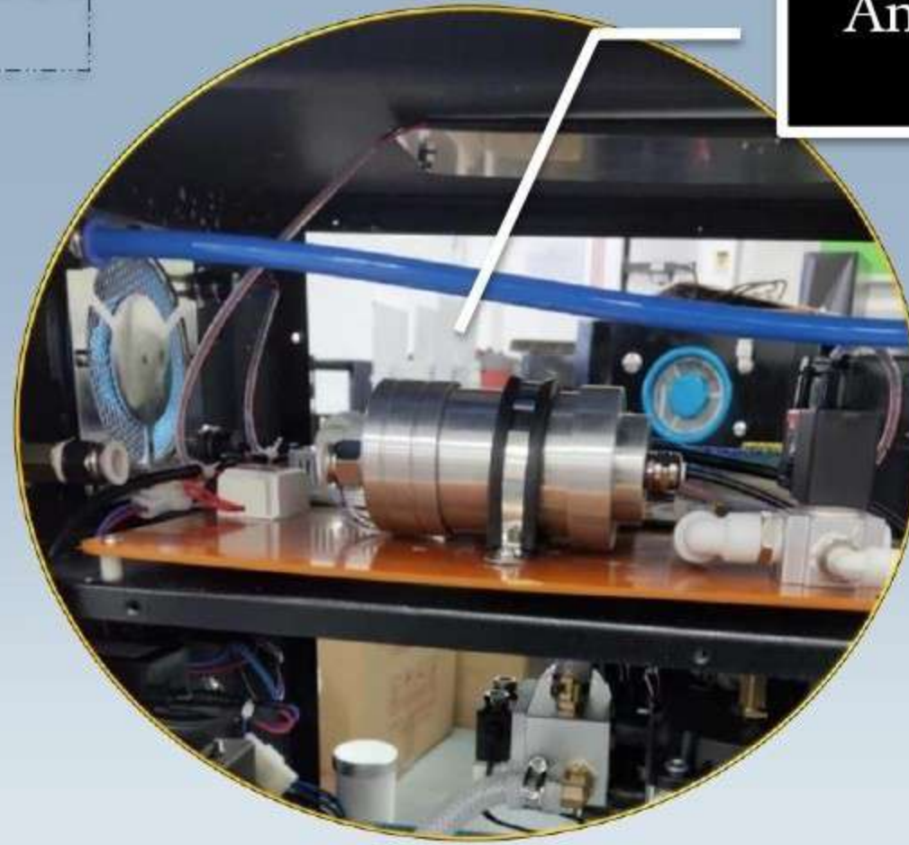
Anti-virus Generator Container

Nano water ions wrapped by moisture can easily adhere to the surface of various bacteria. Then it allows the large amount of hydrogen oxygen free radicals contained in itself to fully contact with the bacteria, and draws out the hydrogen ions from the bacteria and combines them into water. In this way, various bacteria are inactivated and the effect of germ removal is achieved. In addition to deodorization, nano water ions can also penetrate deep into the fiber and extract hydrogen ions from bacteria that form odor, thus achieving deodorization.