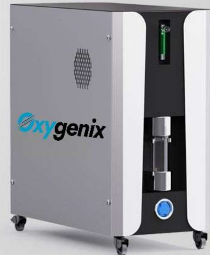
ALL-in-one Operating Unit